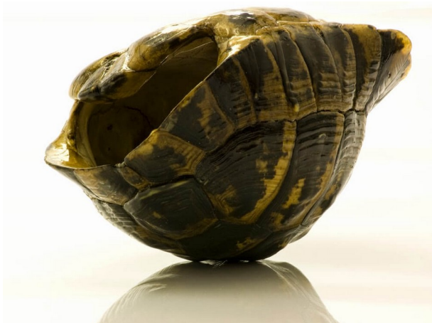
A turtle shell.